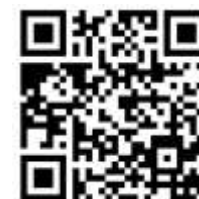
"Scan to give"

Online Giving: Want a convenient way to give, anytime, 24hrs a day? Scan the QR code w/ smart device to reach webpage or visit our website www.sharonsda.net ; click the link on the left "Tithe/Offering". It's safe, secure and an easy way to make your contribution using your checking account and/or debit/credit card. Join others who have found this to be a convenient way to be faithful stewards in returning to God the financial blessings he has given to each of us.