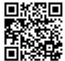
"Scan to give"

Online Giving: Want a convenient way to give, anytime, 24hrs a day? Scan the QR code w/ smart device to reach webpage or visit our website www.sharonsda.net ; click the link on the left "Tithe/Offering". It's safe, secure and an easy way to make your contribution using your checking account and/or debit/credit card. Join others who have found this to be a convenient way to be faithful stewards in returning to God the financial blessings he has given to each of us.